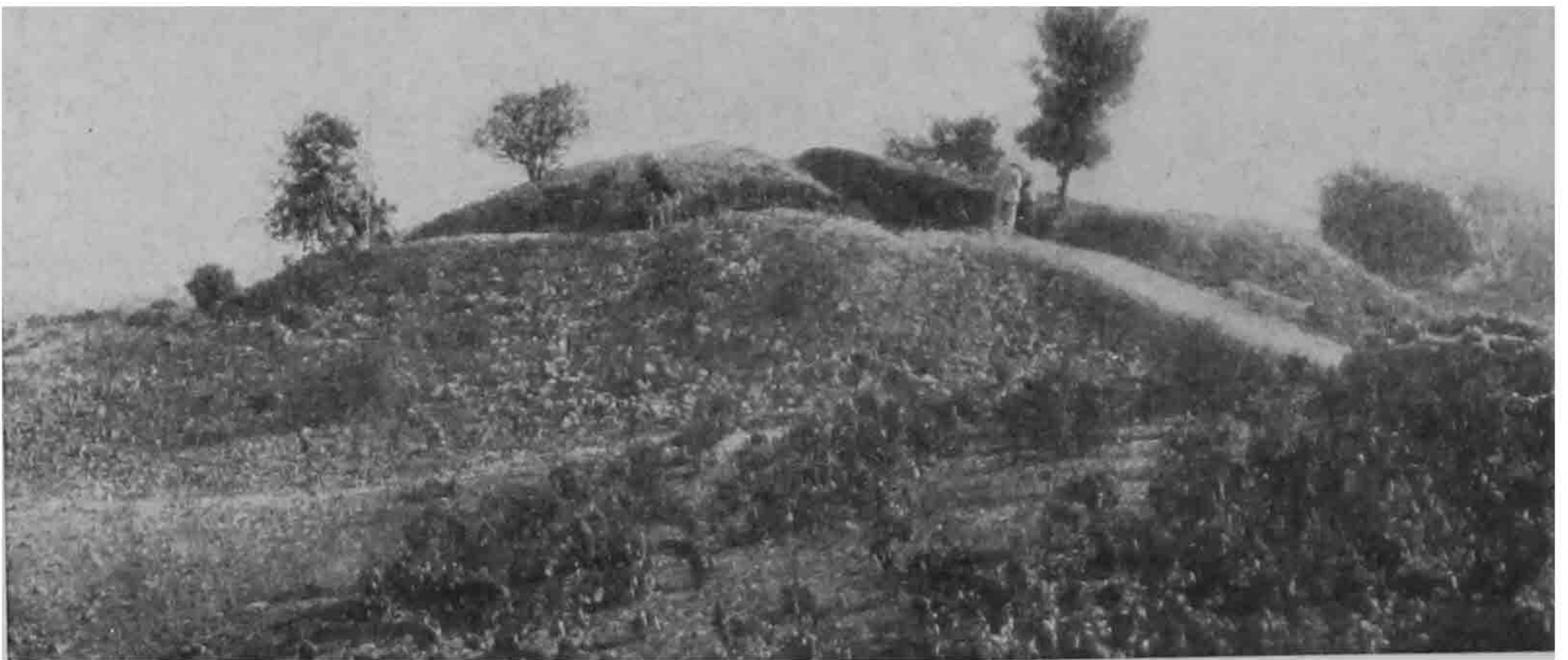
A ruined Sakiyan Tope.