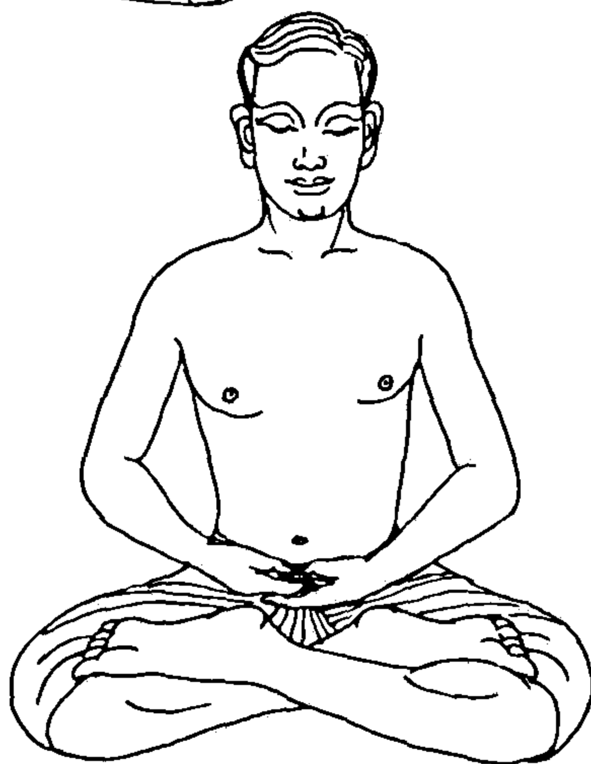
SITTING POSTURES (with various hand positions)