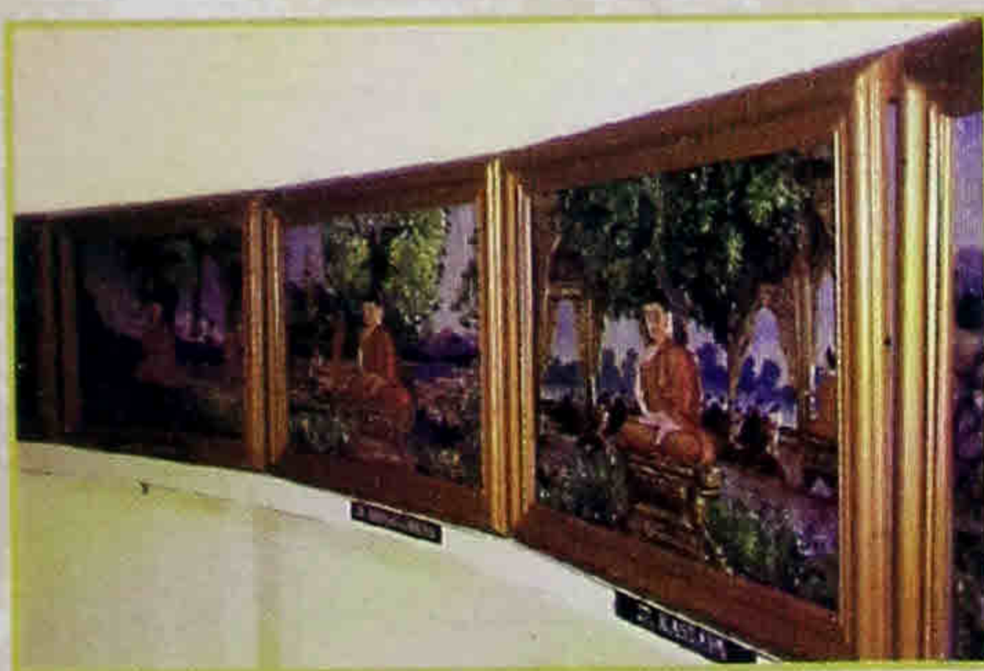
■ Images of the 28 Buddhas line the circumference of the dome