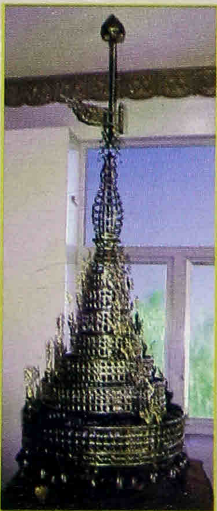
■ The Umbrella or Crown is mounted at the apex of the Spire