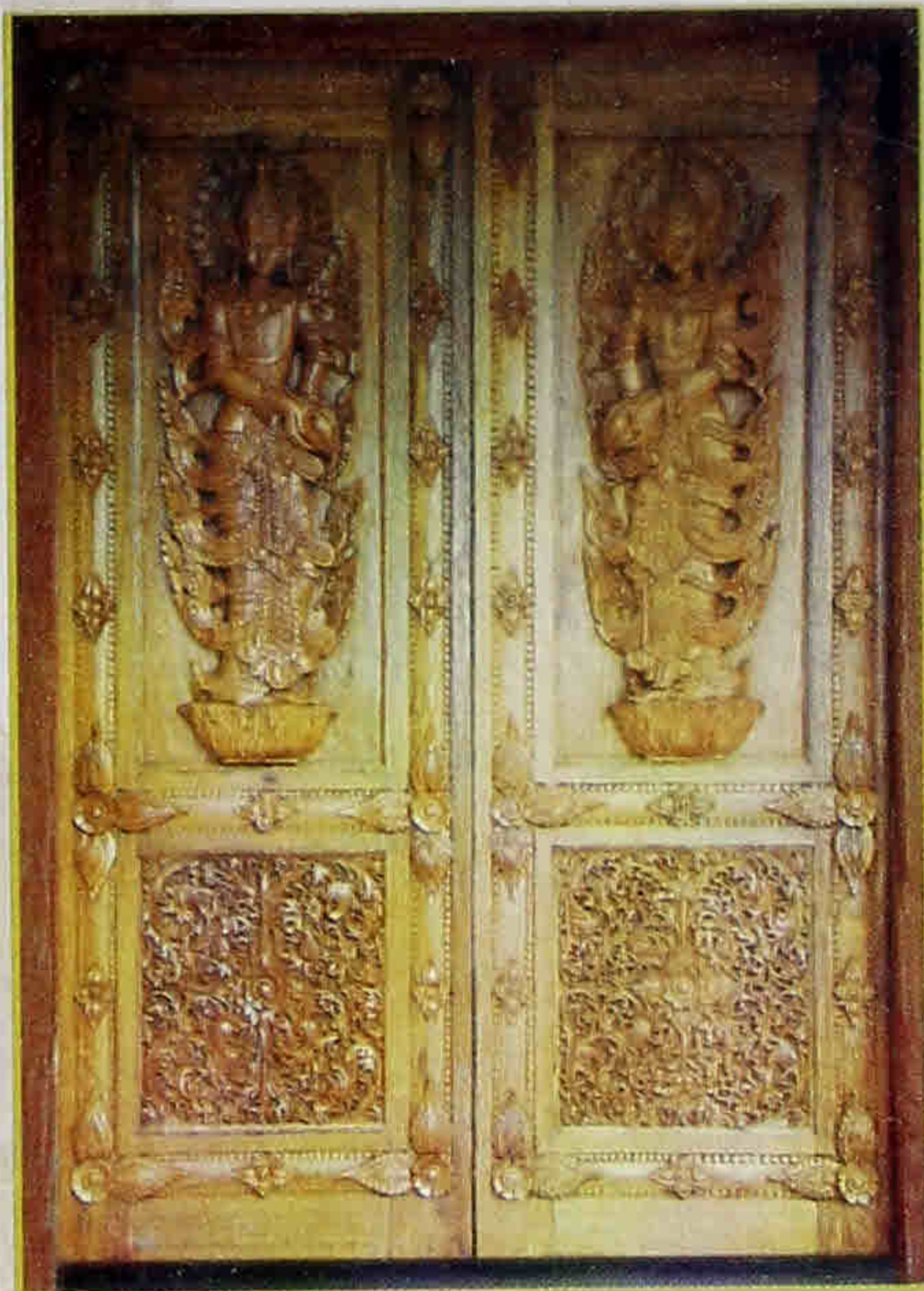
■ Hand-carved teak doors