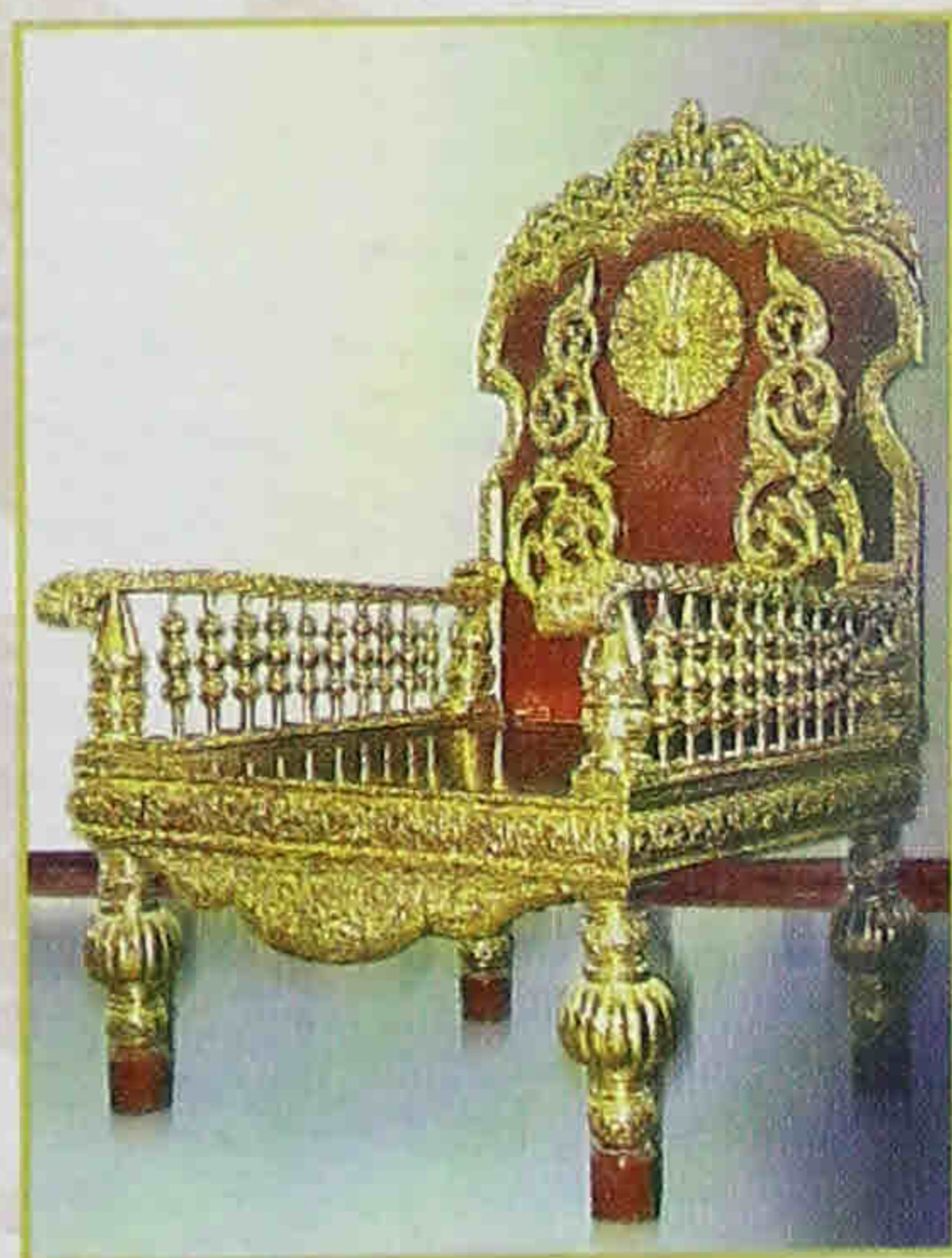
■ Teaching Throne