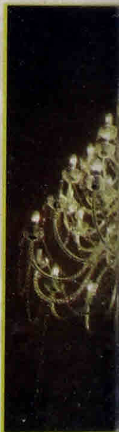
■ Crystal Cha