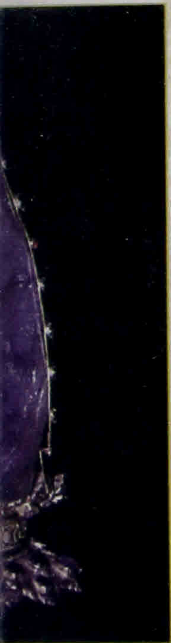
above the Umbrella