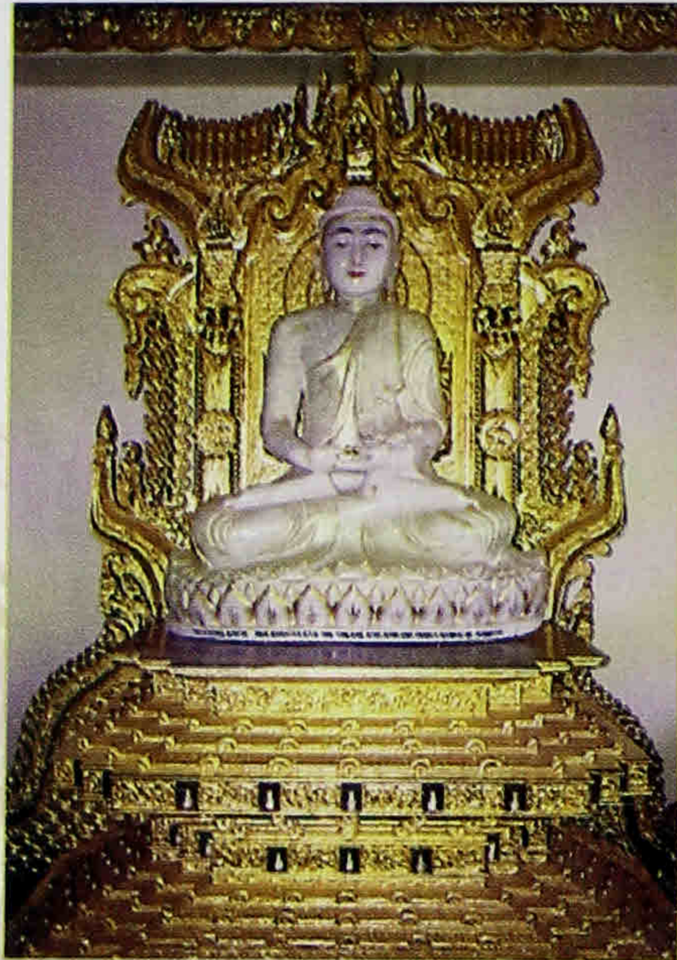
■ The marble Buddha forms the focus within the Pagoda